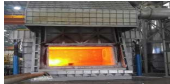
- Melting -