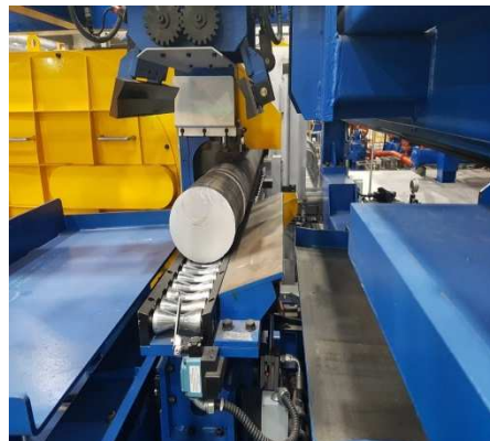
- Billet Hot Saw-