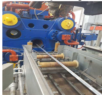
- Water Quenching -