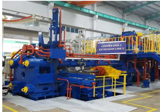
- 2,000 Ton Extrusion -