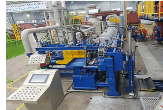
- Billet Heater-