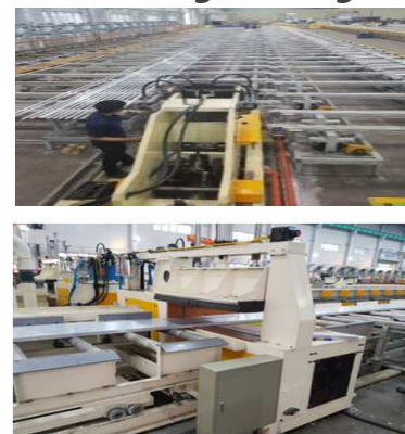
- Stretching / Cutting -